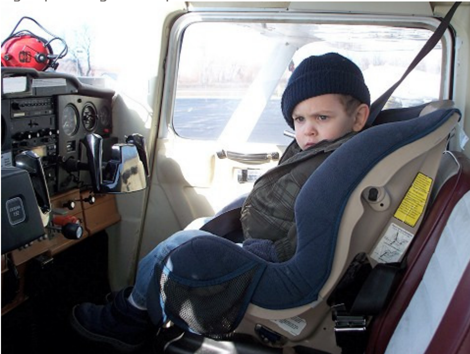
Father Pilot and Junior Co-Pilot ready for takeoff...